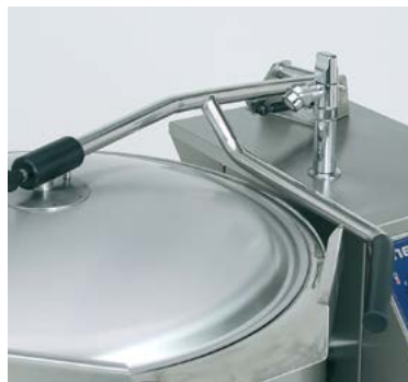
A hinged lid is standard in 150-400 litre Viking kettles and available as an option in smaller kettles.