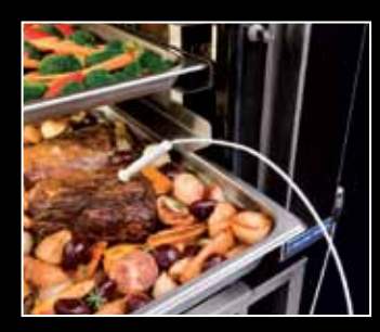
Core temperature probe.

Find the future with the USB-compatible touch screen model – the perfect high-tech solution for menu consistency. With uploading and downloading of product menu programs, you can easily keep multiple units up to date with menu changes.