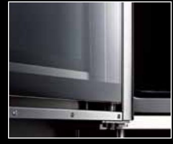
Stay cool vented door.

With the optional Core Temperature Probe fast, concise readings can be taken and faultless outcomes expected. It's this peace of mind that can make such a difference when you've got more things to do than hours in the day.