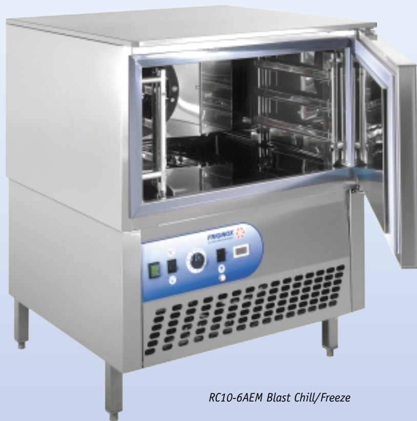
RC10-6AEM Blast Chill/Freeze